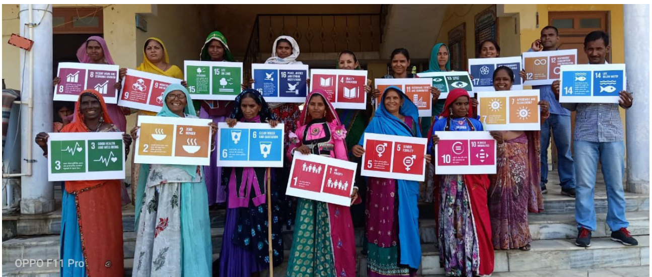
Orientation of elected Panchayati Raj (local administration) representatives on SDGs in Sirohi district, Rajasthan.