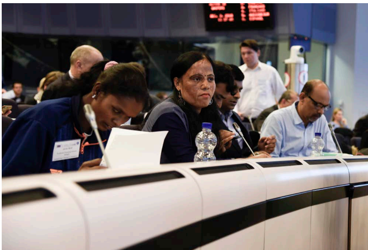
Indian DPO representatives participate in European Disability and Development Week, in partnership with EDF, in Brussels, Belgium, in December 2018.