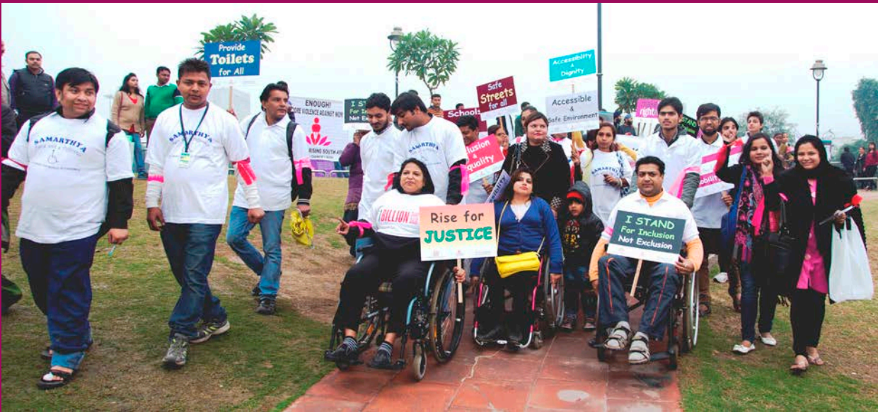
The Samarthyam team promotes mass awareness on violence against women at the One Billion Rising Campaign, 2017.

Access to justice is a challenge. Women with disabilities face a range of barriers, from reporting and interacting with the police to navigating the judicial process. The criminal justice system has largely failed to implement recent reforms, such as creating an enabling, supportive environment for abuse survivors with disabilities. Women with disabilities are often unaware of their legal rights.